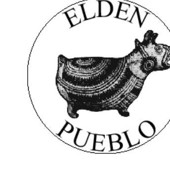
The Elden Pueblo Archaeologícal Project